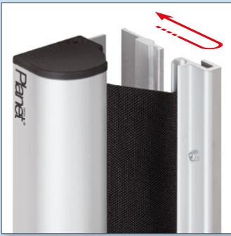
Easy clip-on system