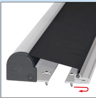
Side view, invisible screws